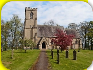
St Mary & All Saints Cundall