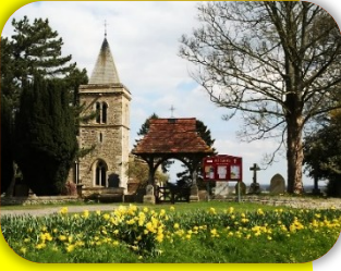
All Saints Kirby Hill