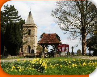
All Saints Kirby Hill