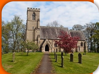
St Mary & All Saints Cundall