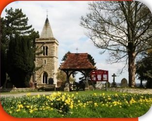
All Saints Kirby Hill