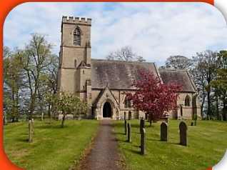
St Mary & All Saints Cundall