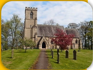
St Mary & All Saints Cundall