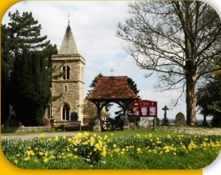
All Saints Kirby Hill