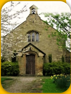
St Helen's Skelton-on-Ure