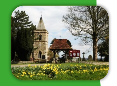
All Saints Kirby Hill