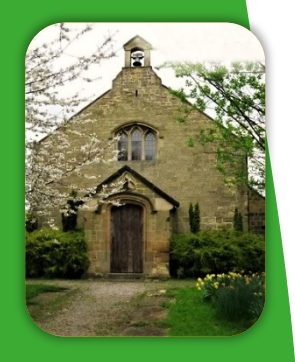
St Helen's Skelton-on -Ure